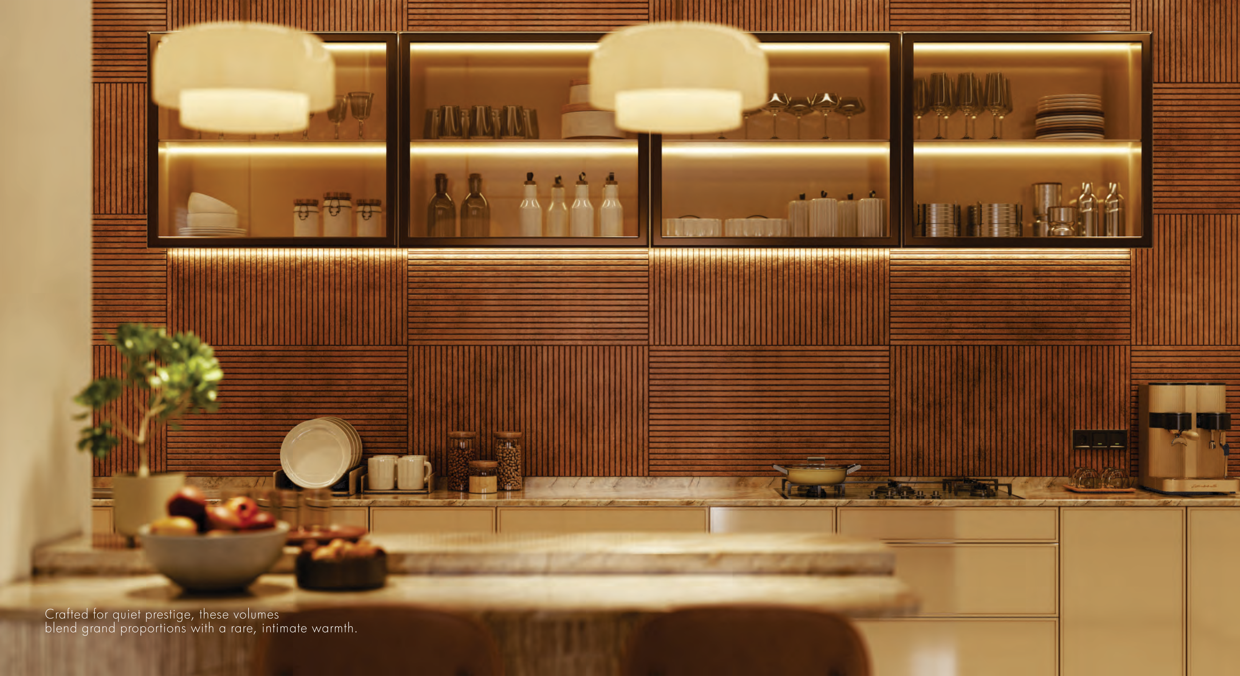
Crafted for quiet prestige, these volumes blend grand proportions with a rare, intimate warmth.